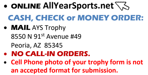
PHOTO / TROPHY PICKUP

Choose ONE team representative to pick up photos and trophies for the whole team.